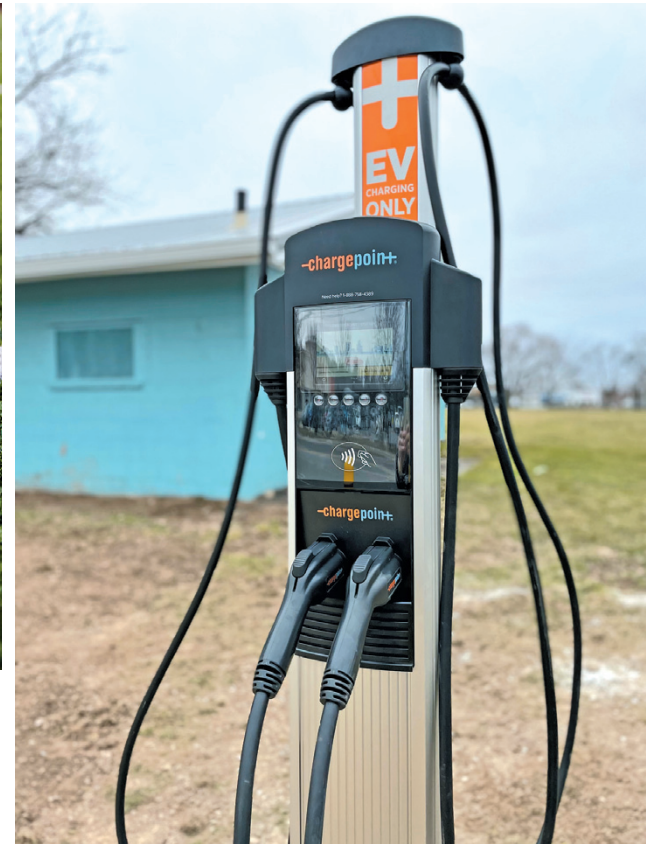
An electric car-charging station was installed this week at Academy Park, just adjacent to the Niagara River Region Chamber of Commerce office and the comfort station.

flag football, which will begin with practice on April 11 and wrap with a year-end two-day tournament on June 10-11. After that, the tackle season is scheduled to run from July 10 through the end of October.